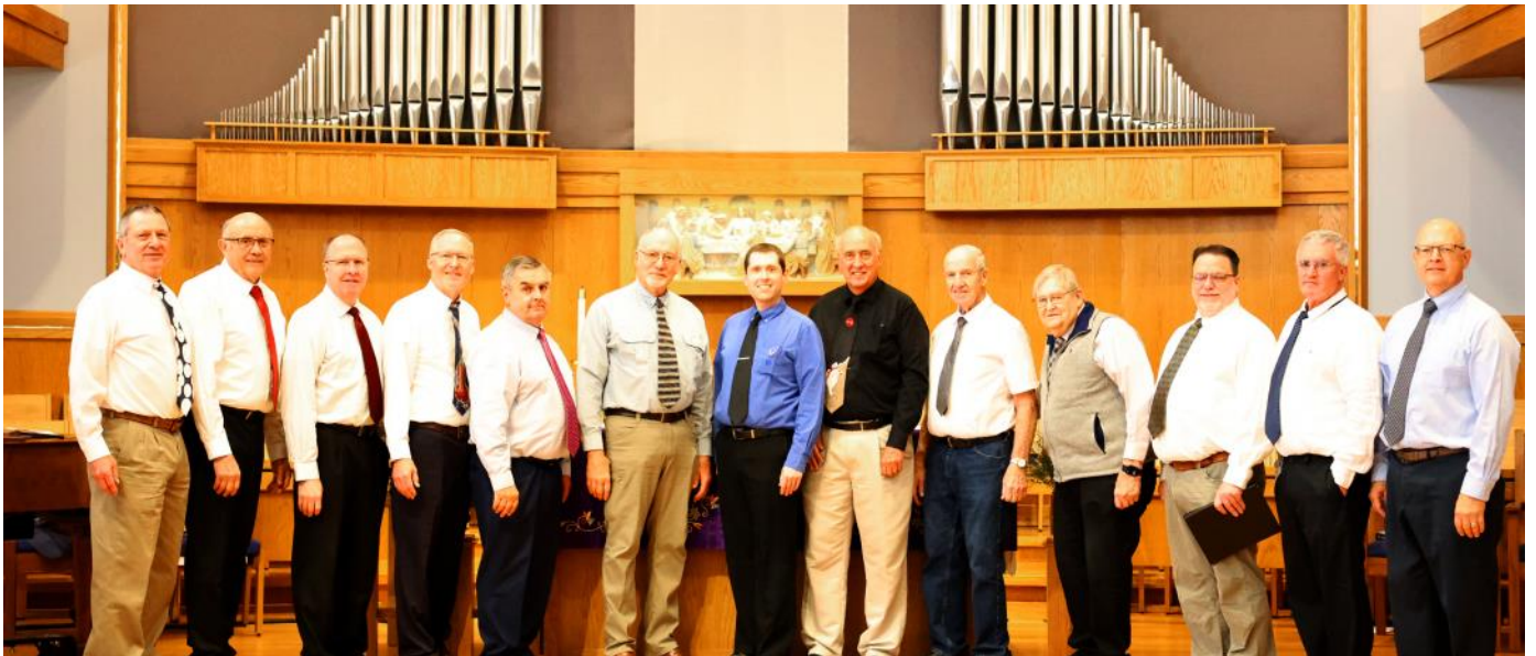
Above - The Men's Choir that performed during the March 16th service.