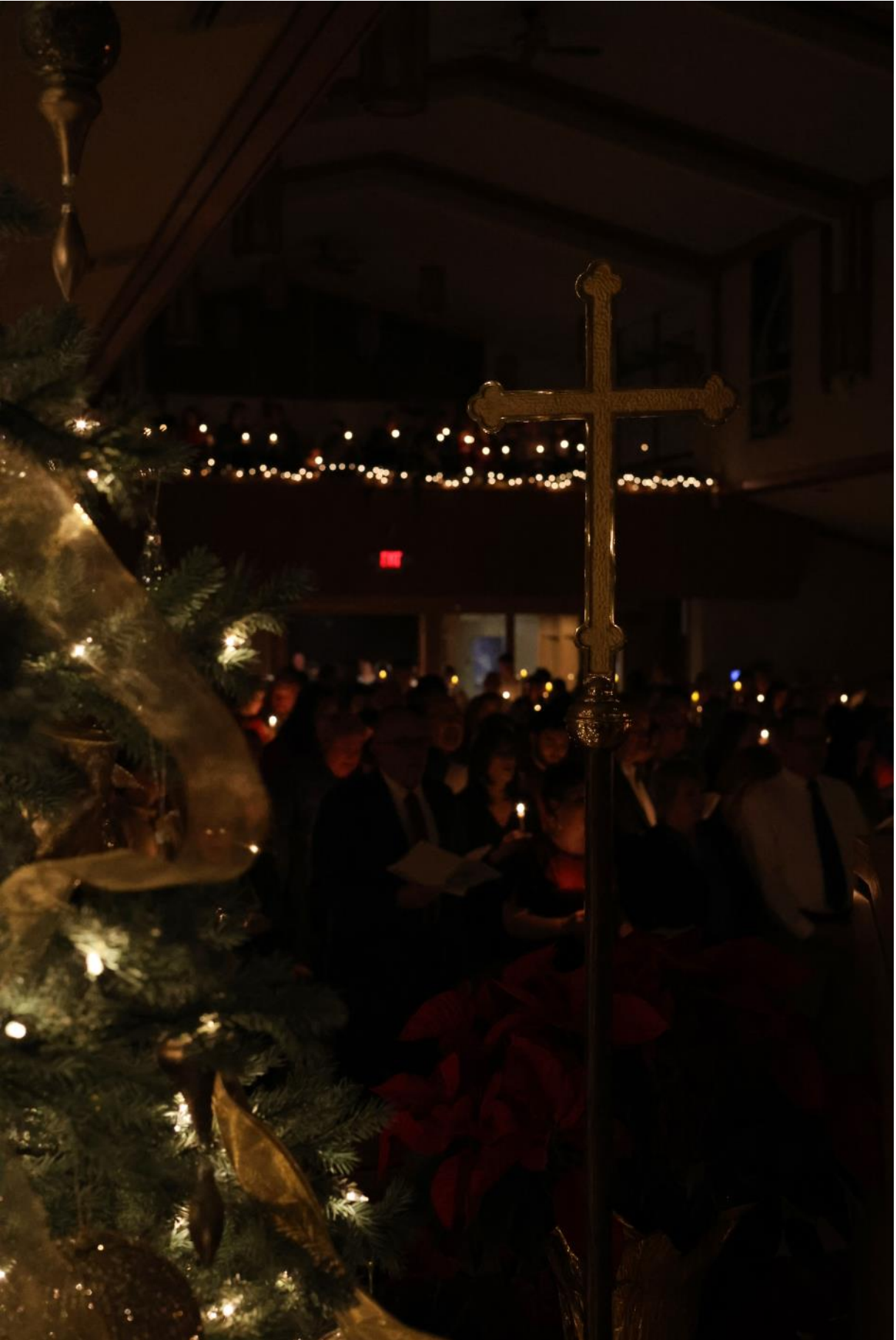
Christmas Eve 5 o'clock service